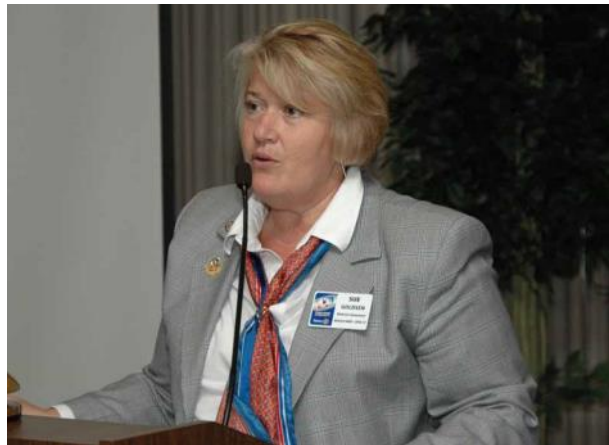
District Governor Sue Goldsen