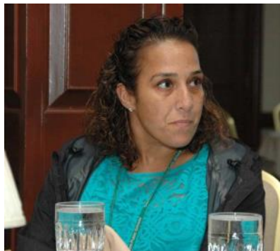
Interact Faculty Advisor is essential person in the success of an Interact Club