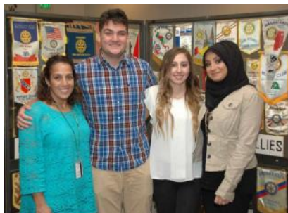
Interactors and both of the Faculty Advisors.