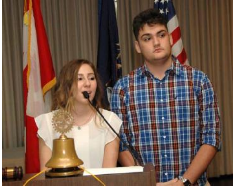
Our featured speakers today from the Fordson HS Interact Club speaking on their volunteer trip to the Dominican Republic.