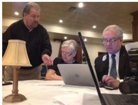
Club members working on logging into DACdb.