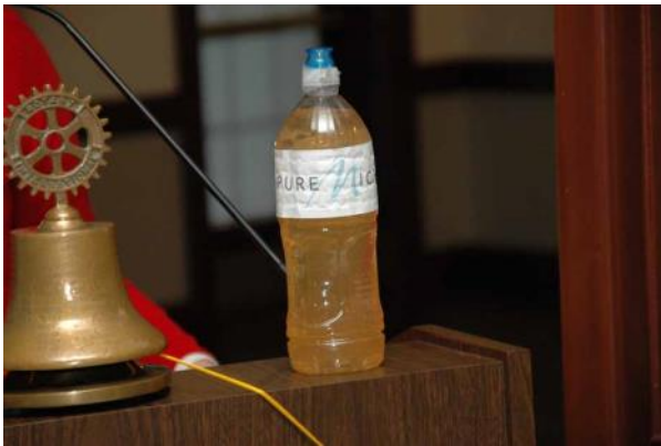
The water in question.