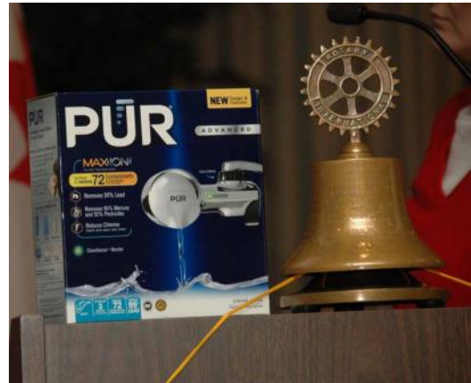
Filters used in homes.