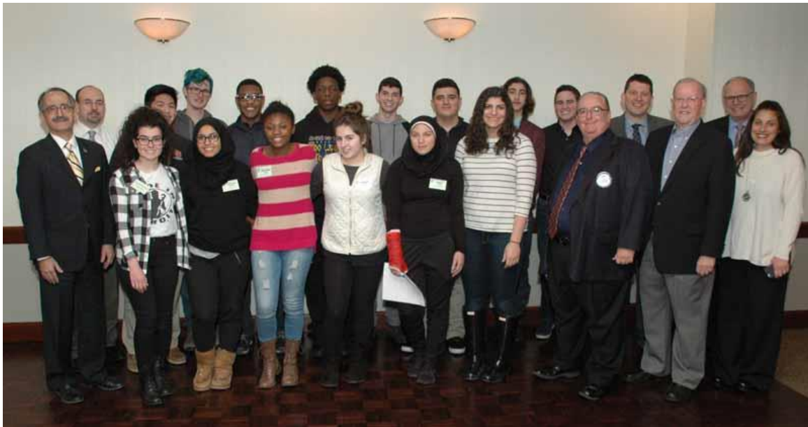
This week our students will run the meeting.