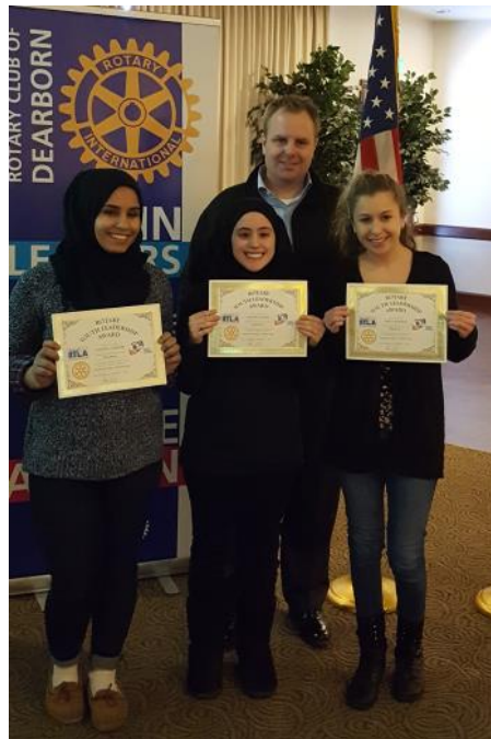
The Dearborn students that attended the RYLA (Rotary Youth Leadership Awards) seminar in November.