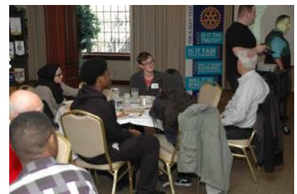
Youth Month Started