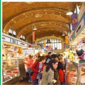
Hungarian (DG Sue's native language)!

#10 Catch a glimpse of Cleveland's melting pot heritage at the bustling indoor West Side Market, where it's possible for visitors to hear someone ordering sausage from a Hungarian butcher -- in Hungarian (DG Sue's native language)!